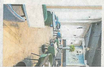
Exciting: Hotel U in Antwerp