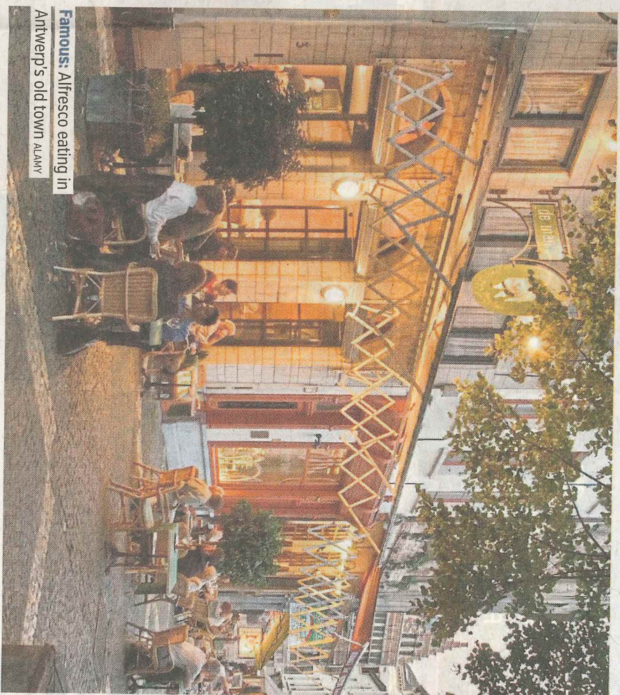
Famous: Alfresco eating in Antwerp's old town

The best-located budget hotel, however, is the Hotel Indigo Antwerp