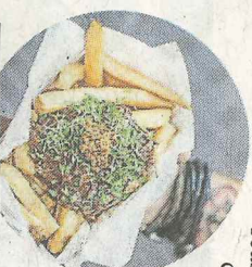
Posh chips: The very Belgian Frites Atelier

rising stars of Antwerp. Among Belgian staples not to be missed are, er, French fries. Michelin-claimed the block back, so